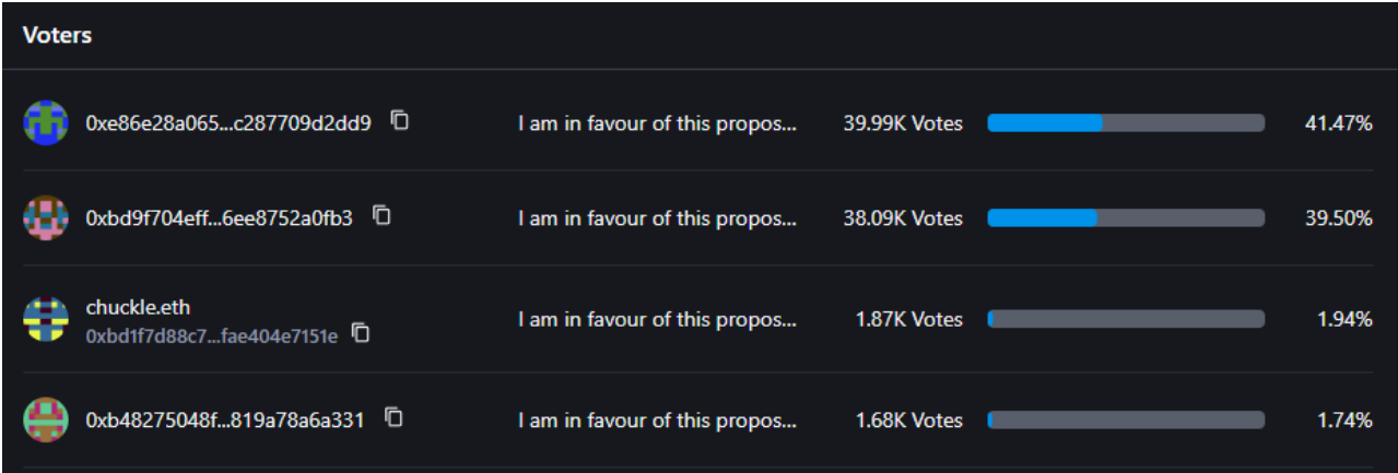
Figure 1. Voters on 1Inch proposal. The figure depicts the voters and outcomes on a 1inch proposal.