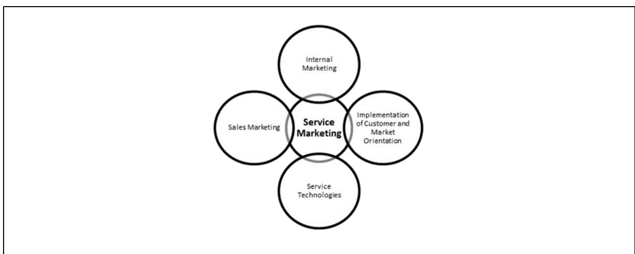
Figure 5: Overview Research Focus (self-provided)