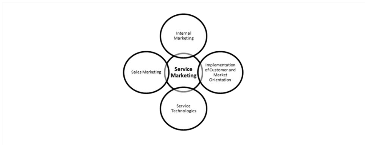
Figure 5: Overview Research Focus (self-provided)